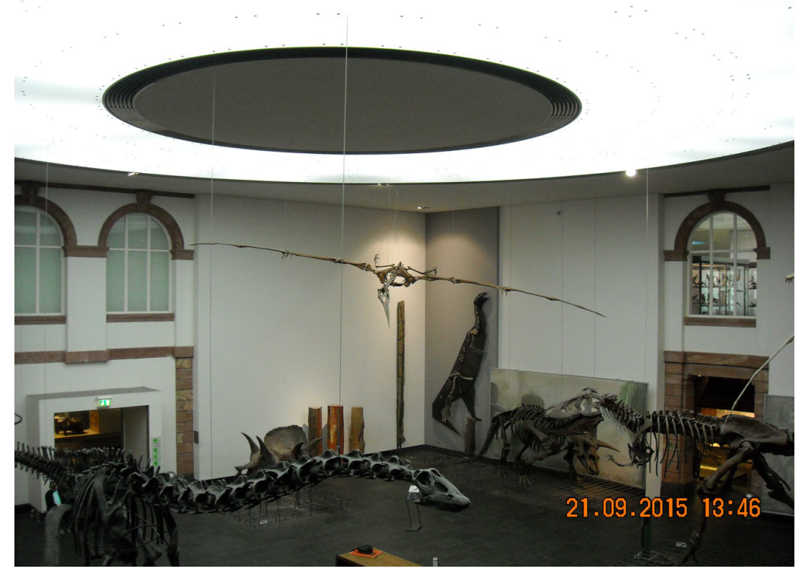
Figure 3.1: Flying Saurian with about 10 m Span

In Senckenberg museum in Frankfurt at Main, flying saurians are exhibited with about 10 m span, which could fly.